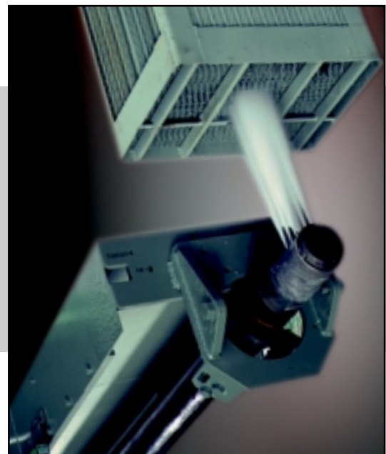
IK-525-DM in high pressure waterwash mode. The air heater cleaner can be mounted vertically (for blowing left or right) or horizontally (for blowing up or down).

Introduced in 1967, the original IK-525 sootblower has long demonstrated its effectiveness and reliability in multiple-cleaning applications. The IK-525 is the platform for the IK-525-DM Air Heater Cleaner. Today's IK-525 design is a product of more than 30 years of proven success.